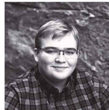
ALEX PAGEL Theater