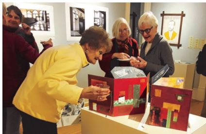
The Northfield (Exhibition) Experience

30 exhibitions were presented in our Main Gallery, Up Gallery and seven satellite spaces serving 253 adult artists , 1,506 youth artists and reaching over 21,000 visitors